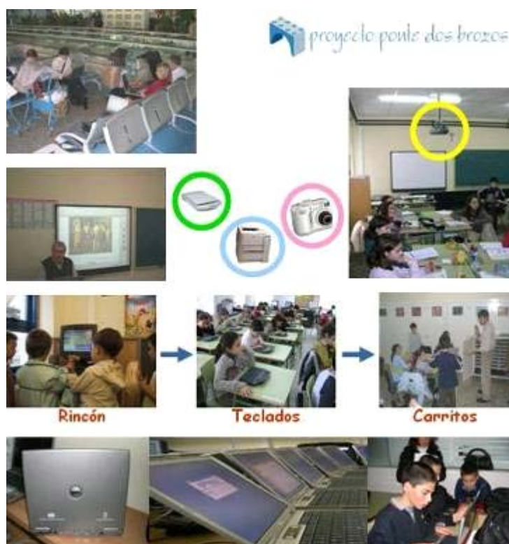
Figure 7: ICT Equipment.

copy services. For disk services it uses Samba technology, emulating an NT domain. In all clients the following network drives, which have a daily back-up copy service and virus scan, are mapped: