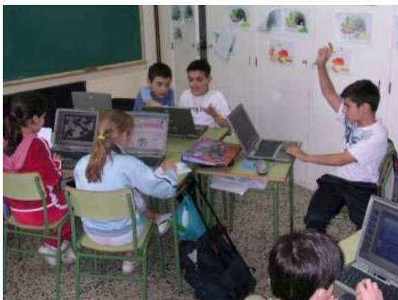
Figure 6: Pupils Preparing a Presentation Using Laptops.

possibilities offered. It is capable of motivating and attracting any pupil, even those hyperactive ones who normally fail at school.