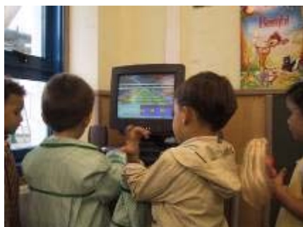
Figure 3: The Computer Corner.

Another good reason to use these popular technologies is continuous