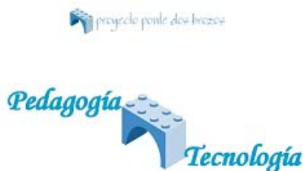
Figure 1: The Bridge as A Symbol.

The social innovation projects carried out by the Amancio Ortega Foundation, < http://www.fundacionamanciortega.org/ >, have a number of identifying traits which can be summarized as follows.