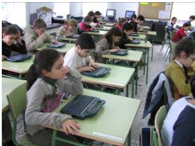
Figure 4: AlphaSmart, A Transition Technology.

from Internet, plus the introduction of a new tool: the AlphaSmart word processor ( Figure 4 ).