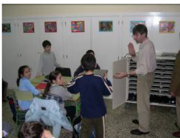
Figure 5: Trolleys.

Another advantage of this tool is the unlimited creative and explorative